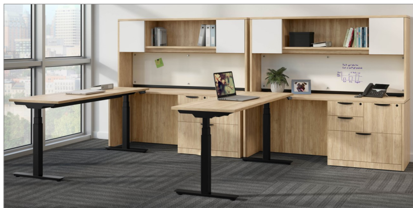
Shown above with aspen finish. PLT tops sold separately.

PLTEAB4872E3S2MWF24-BLACK PLTEAB4872E3S2MWF24-SILVER