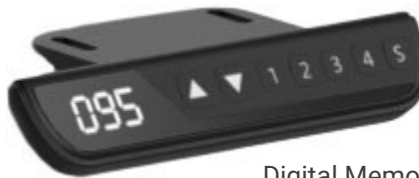
Digital Memory Handset

Packaging for base unit: 1 Carton: (with 1 item per/carton) Overall: 53.94" long x 7.09" wide x 11.81" high Weight: 68 lbs.